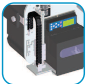
HIGH PRECISION SAFE