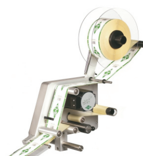
Model 4-120RH (Right-Hand)

Specifications are liable to change without prior notice.