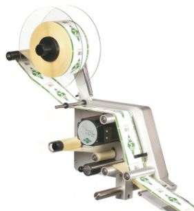
Model 4-120LH (Left-Hand)