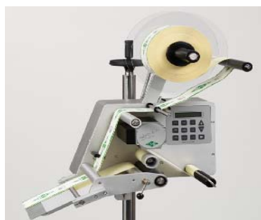
Series 2000 Label Dispenser